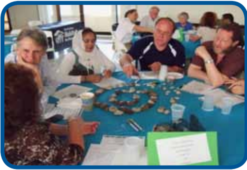
Hartford Habitat's interfaith social, held at the Jewish Community Center, brought together Christians, Jews and Muslims.